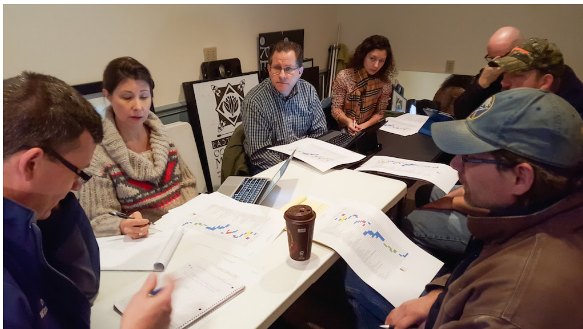
East Aurora Co-op Market construction team reviews progress and timeline.