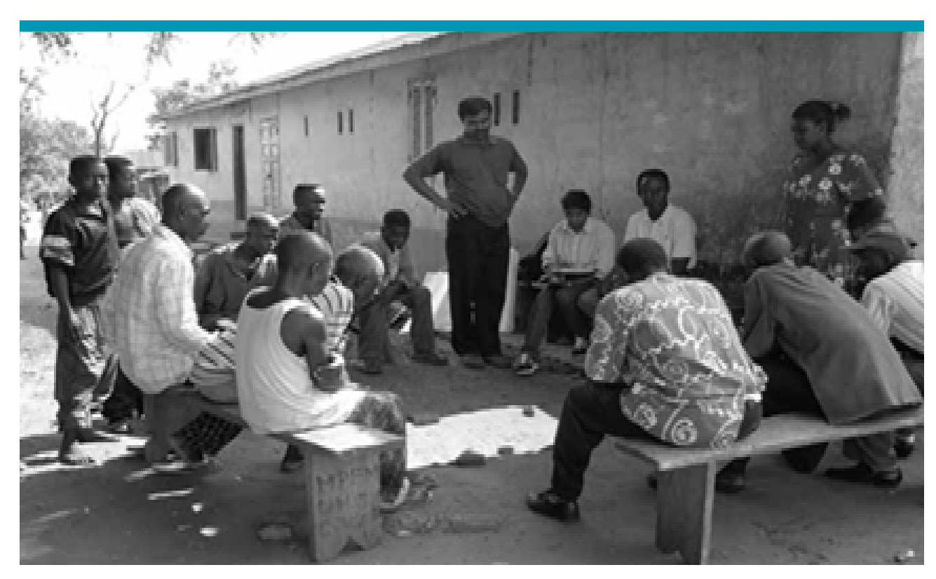
This co-operative education and training session in Rwanda demonstrates the importance of members understanding the values and principles that are the foundation of all co-operatives. This is achieved through education, training, and information especially for young people, women, and opinion-leaders on the nature and advantages of co-operation.

It is worth noting the three distinct ingredients of education in this 5<sup>th</sup> Principle: "education", "training" and "information", each of which has a different part to play in co-operative education.