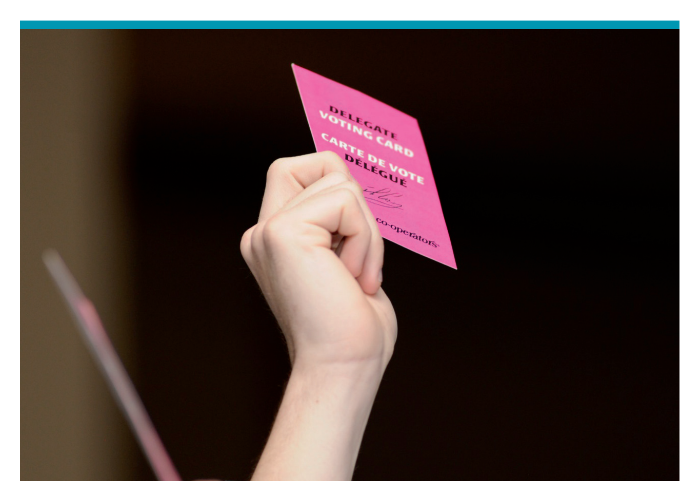
The Co-operators Group Limited is democratically controlled by members. Forty-three corporate members appoint delegates who represent them in the governance of the co-operative. The membership reflects a diverse cross-section of the Canadian co-operative movement, meeting the social, economic, and environmental needs of Canadians.

There needs to be a clear understanding of the democratic rights and responsibilities of the elected board of a co-operative and its focus on the long term enterprise strategy and the role of professional senior management, accountable to the board, entrusted with day-to-day management. Senior executives need to demonstrate their practical commitment to and respect for the principle of member democratic control by the way in which they support and service their co-operative's business decision making. Key strategic policy decisions need to be explained to members clearly, concisely and in a way that the whole membership can understand, with alternative options given where appropriate.