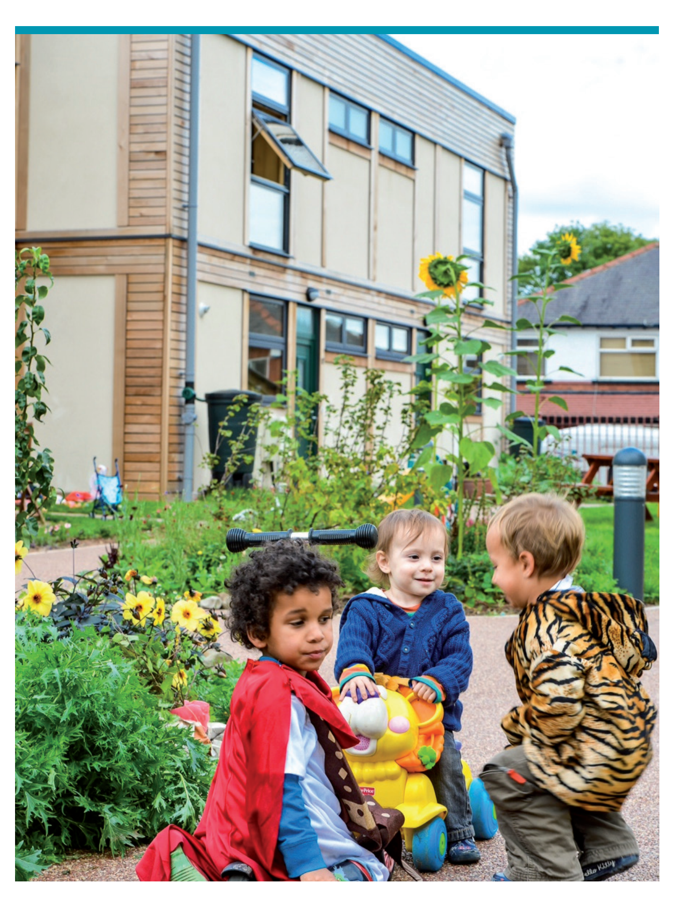
In Leeds, England, members have developed a low-impact-living, affordable housing community (LILAC Co-operative), which demonstrates the three dimensions of sustainability: social, economic, and environmental. It treads lightly on the earth, and its finances are structured to ensure that homes will remain affordable for future generations.

Co-operatives have always played a significant role in promoting global peace and social cohesion. Application of the Co-operative Values and Principles by co-operatives create a unique capacity to contribute to global peace and prosperity. All co-operatives should give consideration to the contribution they can make in their local communities and beyond to peace, social solidarity, social justice, and prosperity for all.