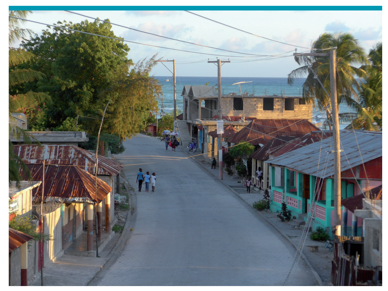
In Haiti, 19 US-based electric co-operatives and 37 volunteer linemen worked with the National Rural Electric Co-operative Association (NRECA) International to help build Haiti's first electric co-operative. The possibilities are now endless for three towns in the southwestern region of the country, because a better life starts with power.

desirable that smallholder farmers not only work together to set up primary/village level co-operatives, but that these co-operatives work together through secondary co-operatives to secure better market access, marketing and storage facilities. The creation of secondary and apex organisations is a helpful way to build strong producer organisations.