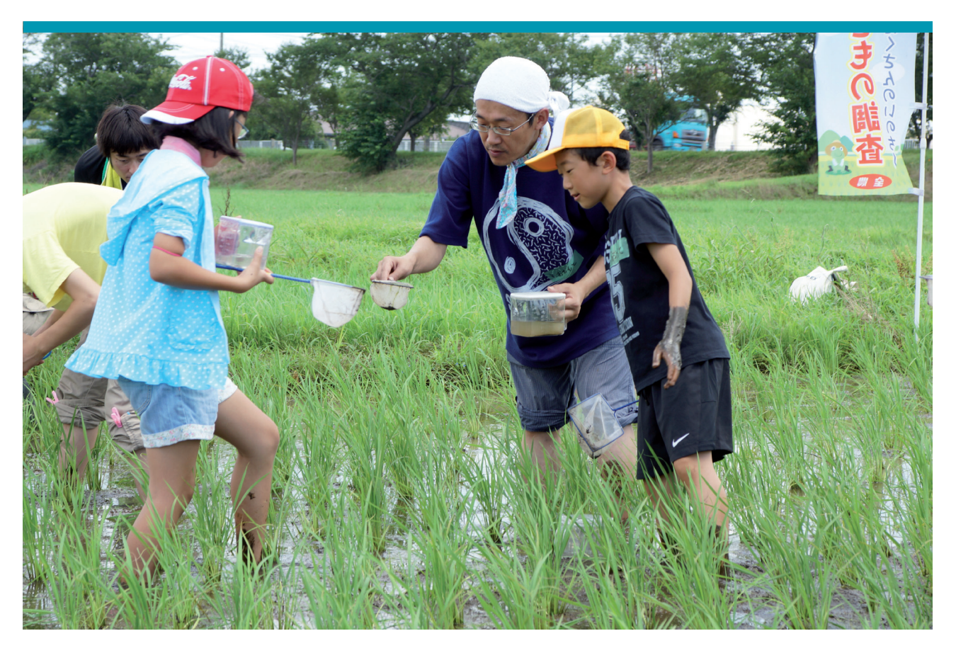
For Japanese co-operatives, the environmental dimension of concern for community in the 7th Principle means counting bugs! In Japan, agricultural co-operatives are major food producers and farming can have significant environmental impact. In the annual "Rice Paddy Organism Survey" promoted by ZEN-NOH (The National Federation of Agricultural Co-operative Associations), co-operative members, local consumers and their children paddle in rice paddies to carry out an ecological survey of plants, insects, frogs, birds and other organisms to ensure that farming does not impact adversely on the ecosystem of the paddy fields. By participating in the survey children learn about nature and become aware of the close connection between agriculture, food, the impact human actions have on the natural environment and the importance of maintaining biodiversity.

can form or join secondary co-operatives or federations to purchase employment advice and human resource management services.