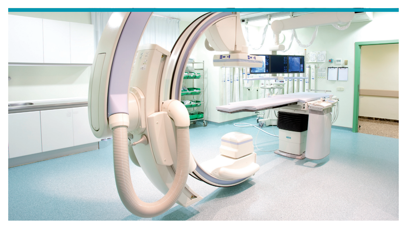
This state-of-the-art, medical, facility is part of Hospital Barcelona, Spain, which is democratically governed by co-operatives. Scias co-operative, integrated in the Espriu Foundation, governs Hospital Barcelona through an Advisory Board made up of 15 members. Of those 15, 12 represent 166 000 user members and 3 represent 800 worker members.

by the co-operative.<sup>2</sup> Co-operatives should aspire to the best, open, transparent, and accountable democratic practice. Each co-operative's democratic practices should be subject to diligent critical assessment, which may be achieved through co-operative specific audits.