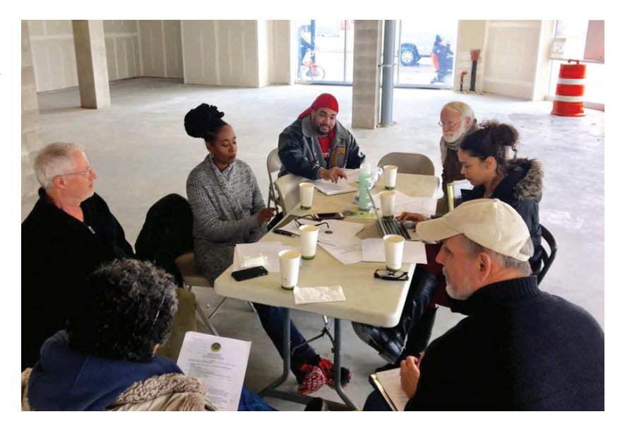
Wirth Co-op meeting in new North Minneapolis space, January 2017.

The City of Columbia's Business Development Opportunity Department came to the table ready to offer business development grant funds to help get things going. That quickly led to a meeting and office space being provided, help with funding for early exploratory and incorporating steps, and funds to send four people to the 2017 Up & Coming Food Co-op Conference in Milwaukee. The strength of the partnership showed: conference attendees were a blend of city workers and members of the fledgling co-op startup team. Their assistance continues today as the City Foods Cooperative Marketplace grows ownership and